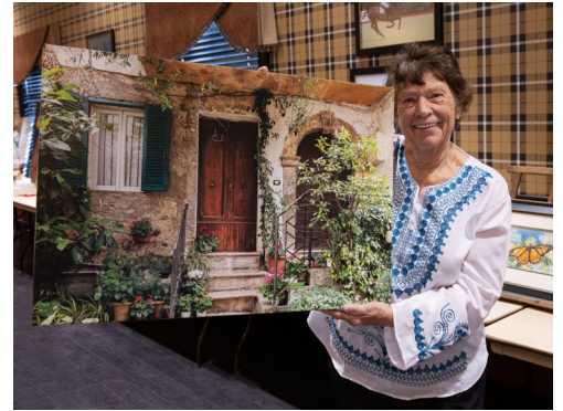
Some art from last January—.