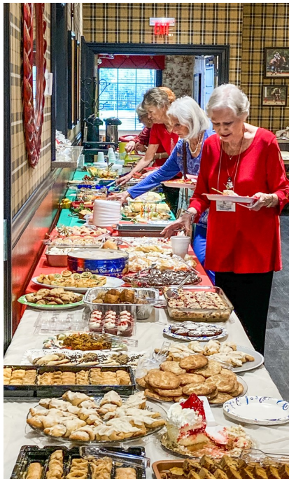
Goodies brought by our Members.