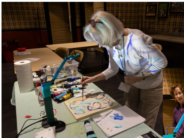
September Meeting's Franklin Painting Photos