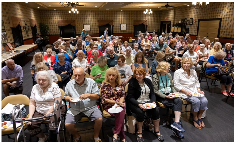
October VAL meeting attendees.