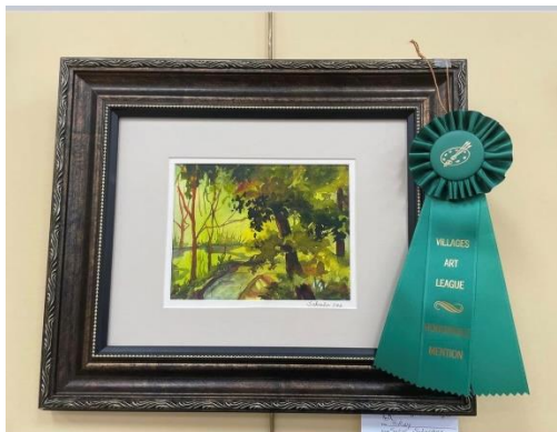
Honorable Mention - Hiking Suzie Schreiber Watercolor