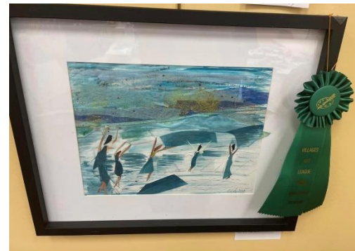
Honorable Mention - As Night Gives Way to Light Nilda Velez Paper on paper