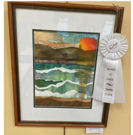
Third Place - A New Day is Born Josie Vogel Watercolor