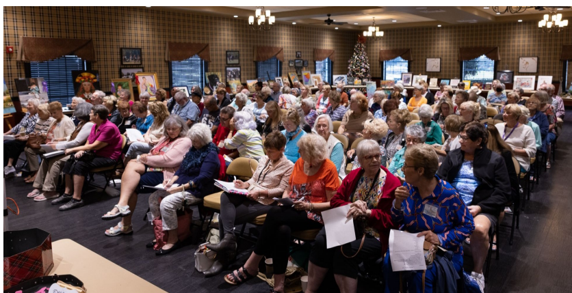
Great attendance at January 2, 2023 meeting