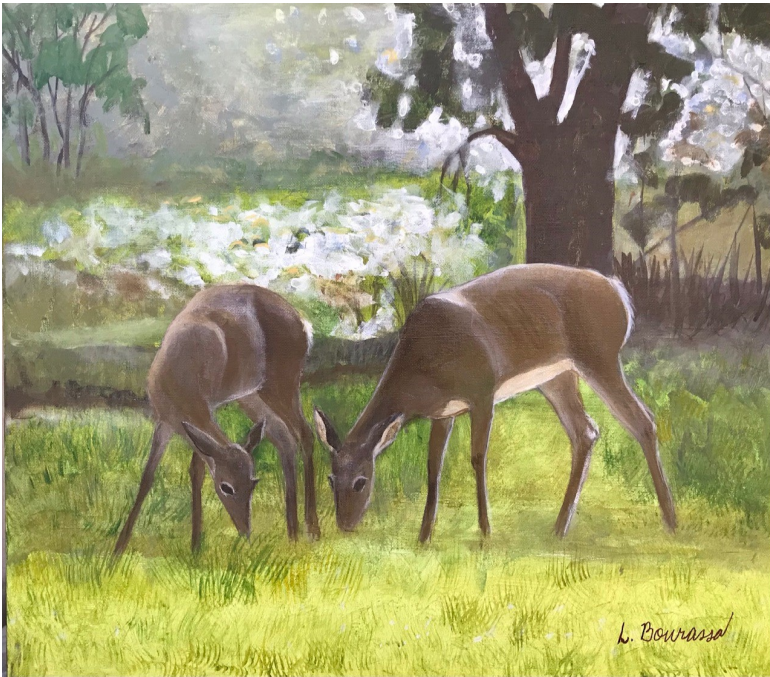
Linda Bourassa-Acrylic "Girls' Day Out"