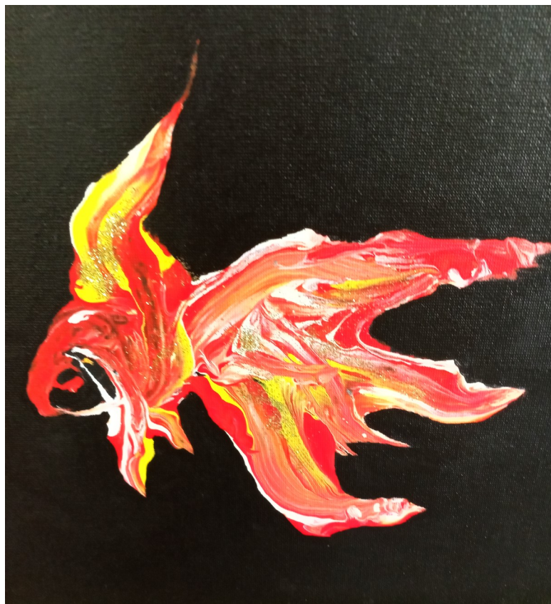
Linda Holcomb-Acrylic Pour "Red Fish"