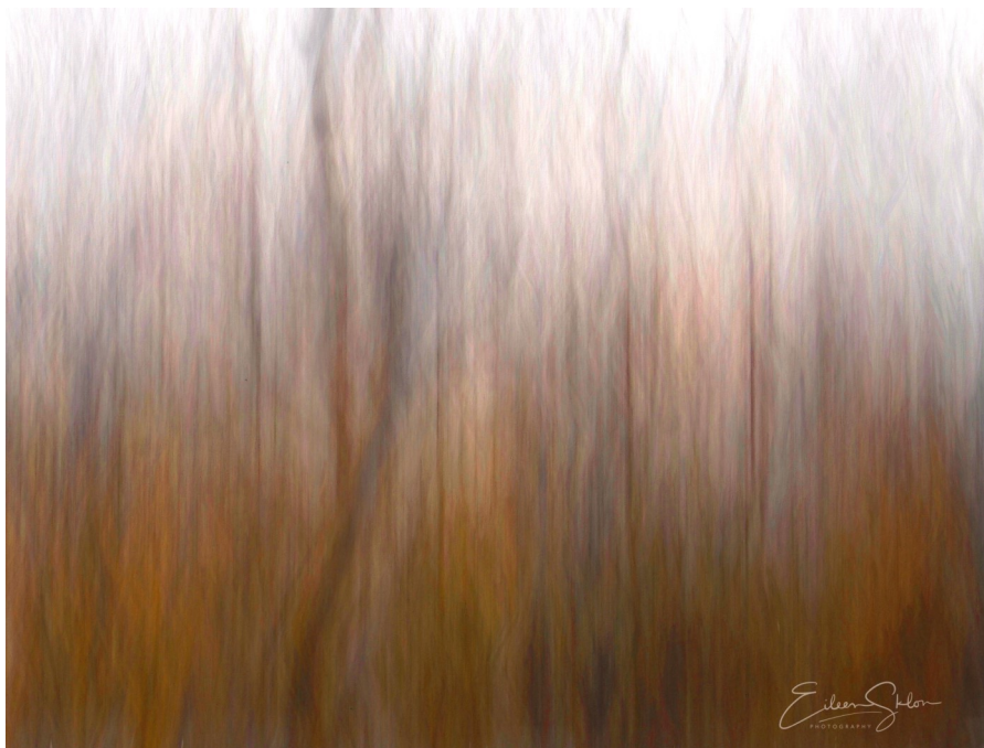
Eileen Sklon-ICM Photography "Last of Autumn"