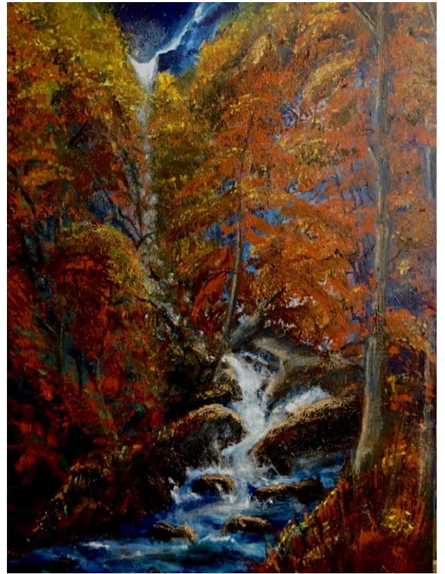
Colleen Farrell-Acrylic/Pastels "Autumn Hike"