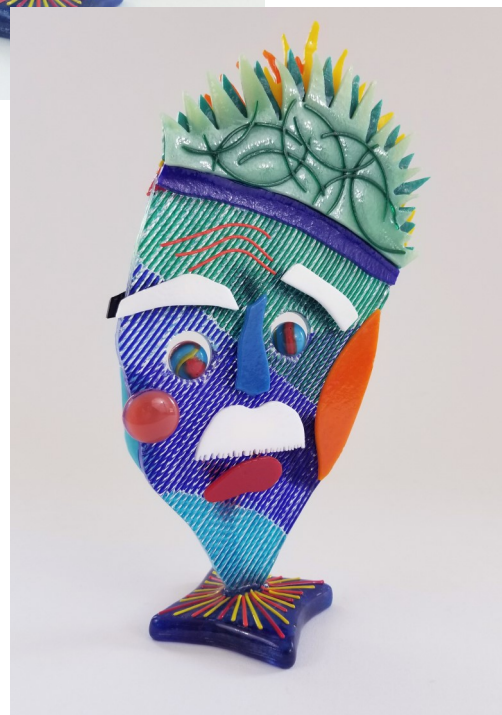
Wolfgang Mueller-Fused Glass two-sided Sculpture "Cute Gnome Character"