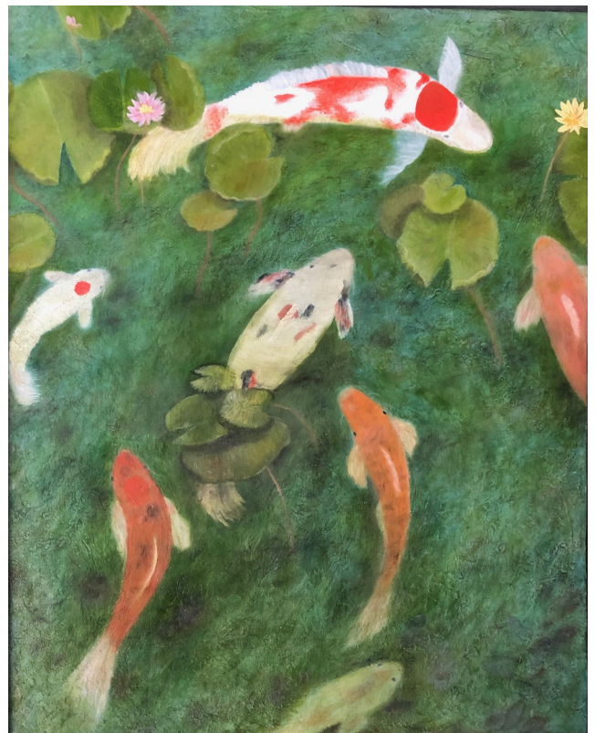
Phyllis Bates-Oil with Cold Wax "Koi Pond"