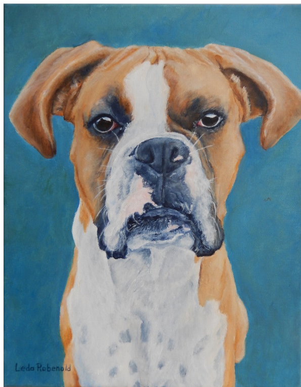
Leda Rabenold-Acrylic "Ruger"