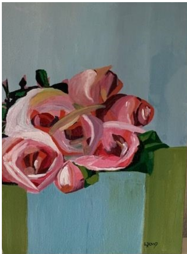
Lois Dowd-Acrylic "Abstract Roses"