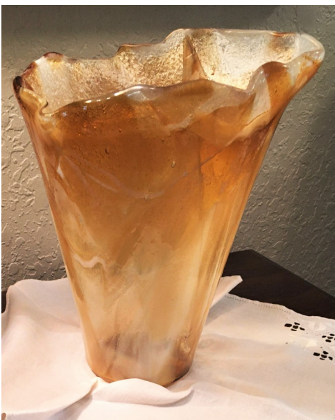
Rollin Williams-Fused Glass "Floral Vase"