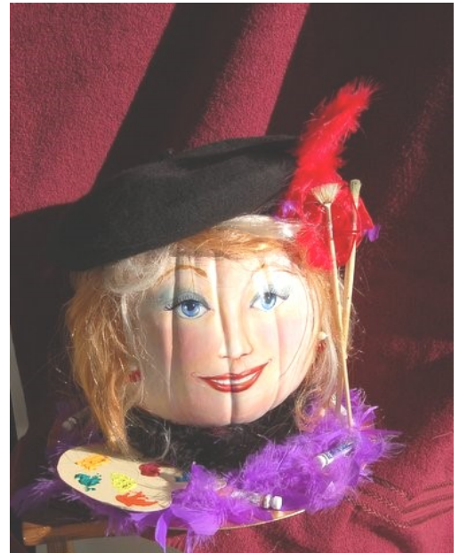
Helen Poor-Pumpkin Gouache Collage "The Pumpkin As Artist"