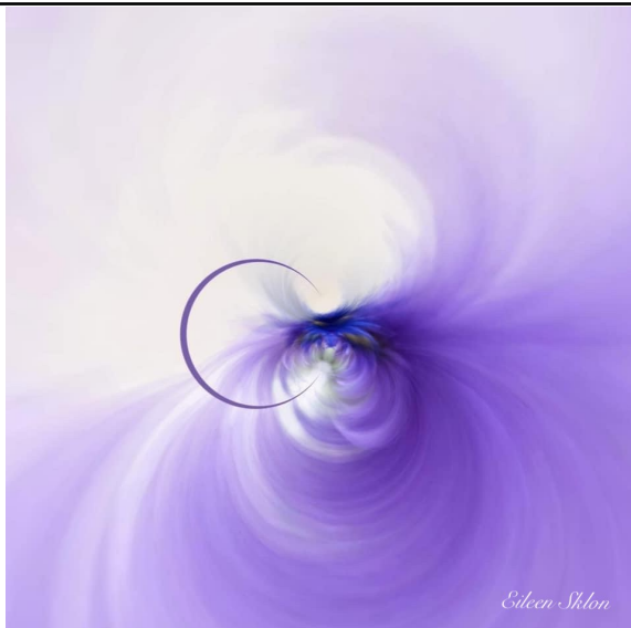
Eileen Sklon-Photography "Shades of Purple"