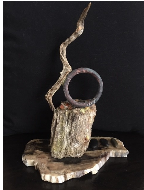
Colleen Farrell-Sculpture "Recycling Found Treasures"