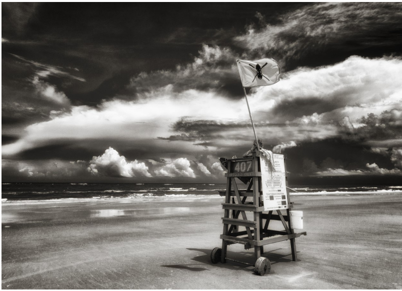
Dave Boege-B&W Photography "Lifeguard Stand #407"