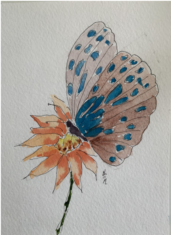
Marge McQueston-WC card "Butterfly "