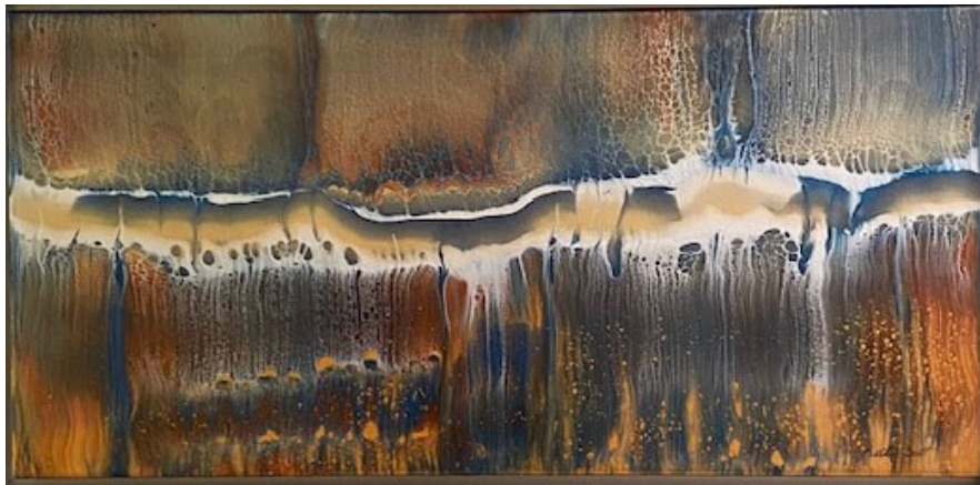
Kathi Scott-Acrylic Pour "Sunset Stream"