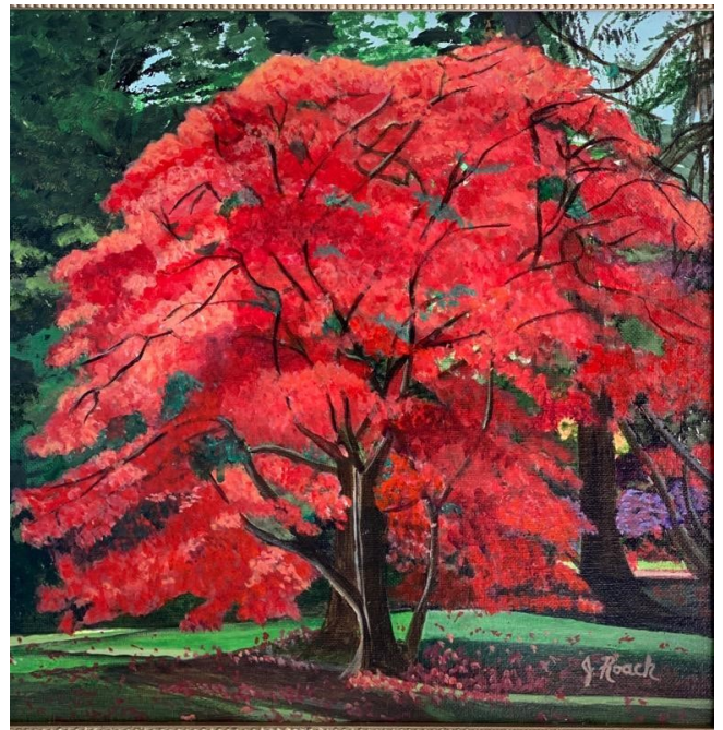
Judi Roach-Acrylic "Red Maple"