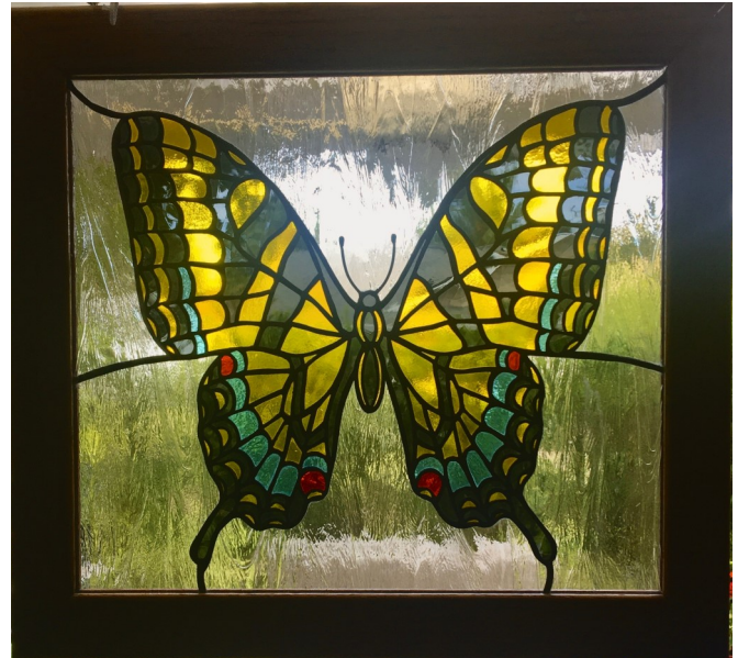
Tom Bray-Stained Glass "Swallowtail Butterfly"