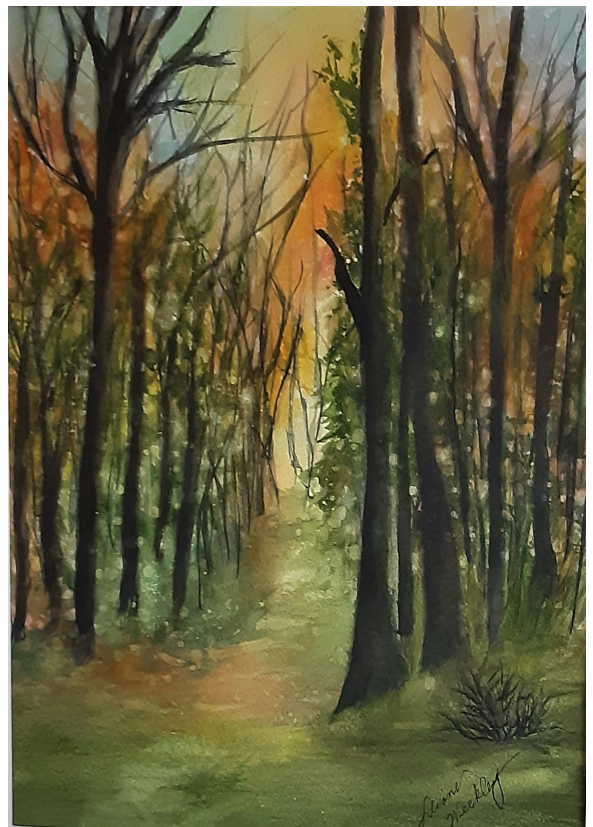
Diane Weekley-WC "A Walk in the Autumn Woods"