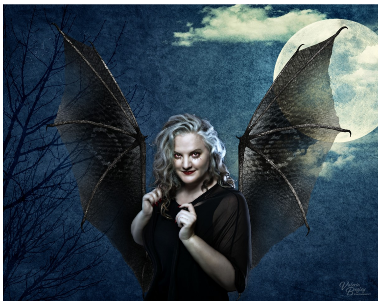
Valerie Begley-Photographic Composite "Happy Halloween!!!"