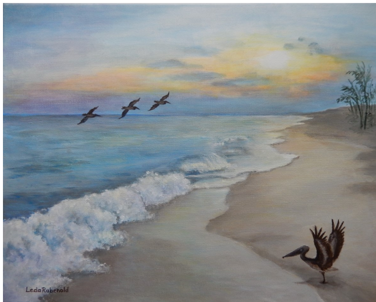
Leda Rabenold-Acrylic "Fly Away"