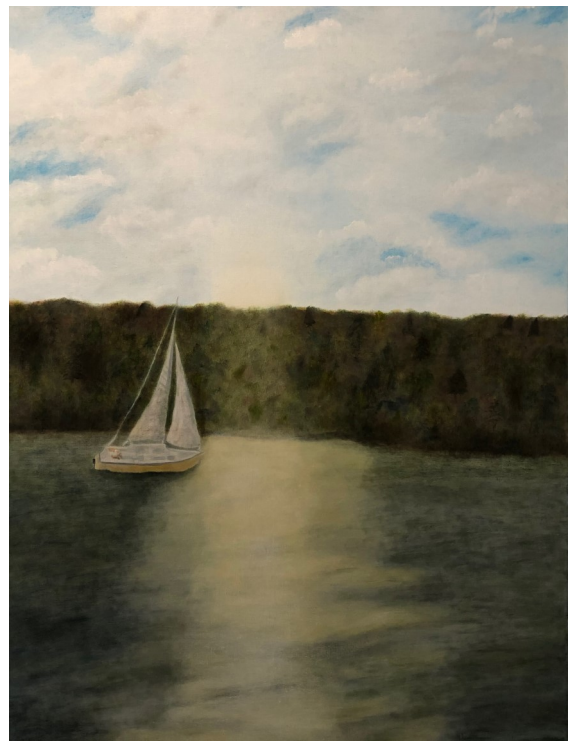
Phyllis Bates-Oil "Sunset Sail on Keuka Lake"