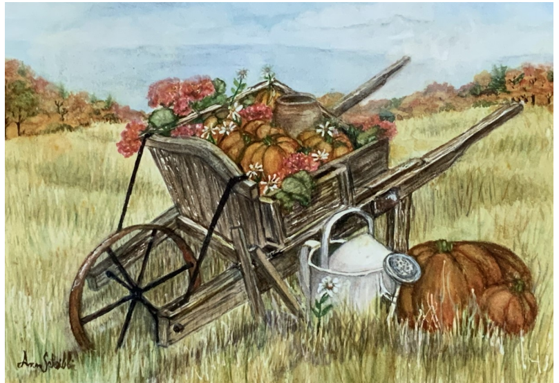
Ann Scheiblin-WC "Autumn Harvest"