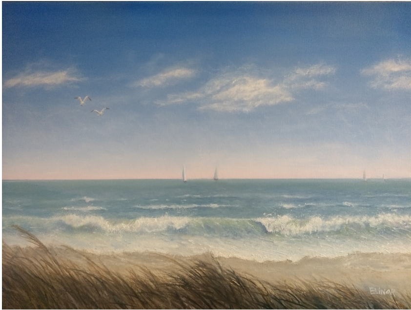
Ellie Leshinski-Oil "Beach with Sailboats"