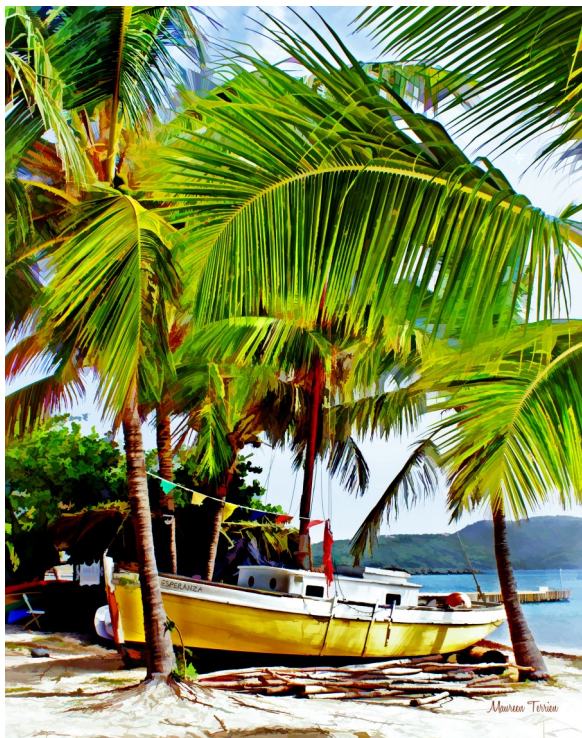
"Esperanza, Tortola, BVI"