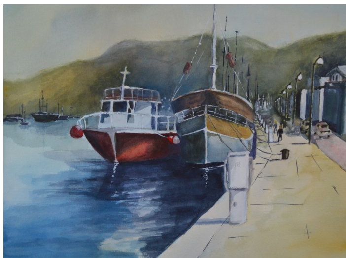
Cheri Ptacek-WC "Two Boats in Croatia"