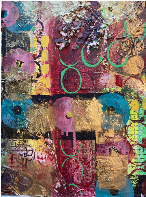
Leona Asta-Mixed Media "Tapestri de Gitanos"