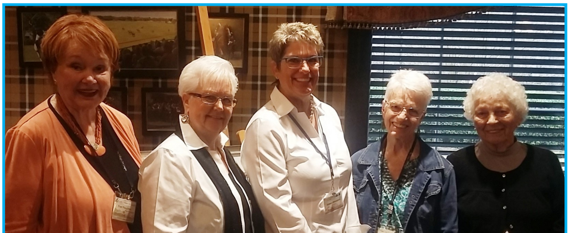
2019 Officers of The Villages Art League