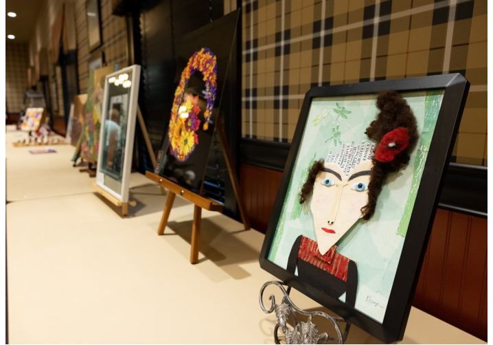
during June 2021's Member-to-Member meeting.