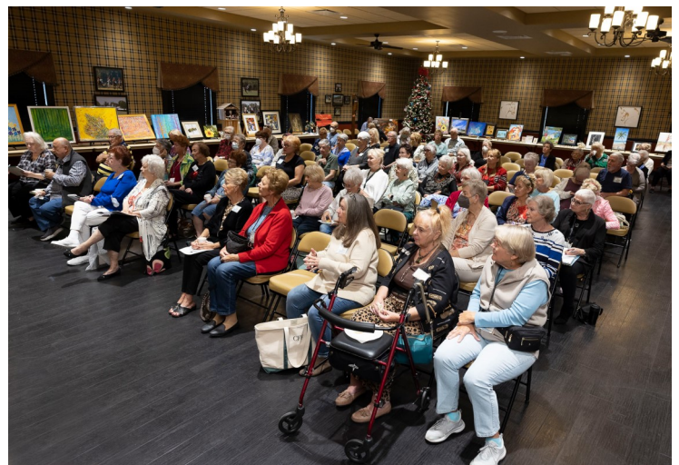
VAL meeting - January 3, 2022