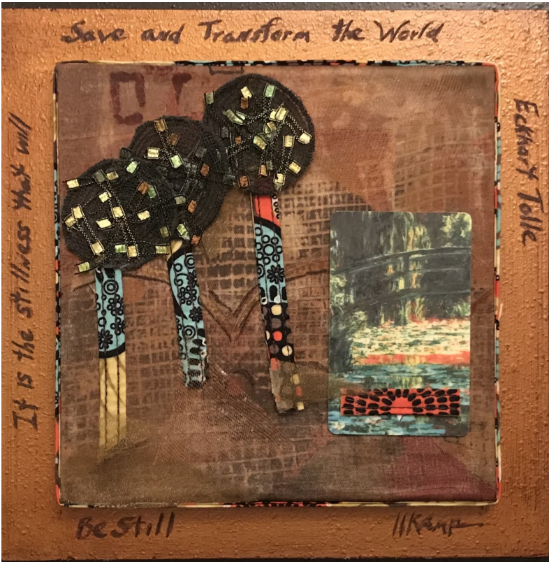
Lois Kamp-Mixed Fiber Art "Be Still"