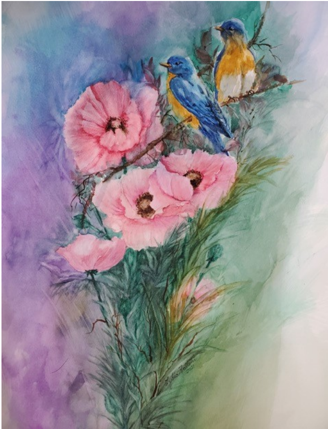
Lydia Falletti-WC "Two Little Birdies Hanging Out"