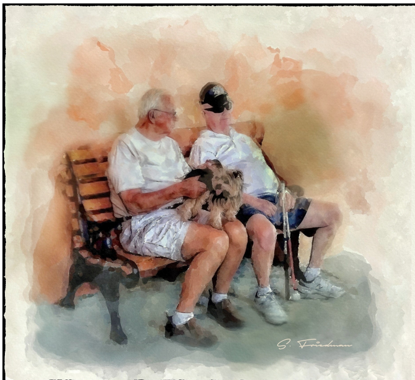
Steven Friedman-Digital WC from Photo "Old Friends"