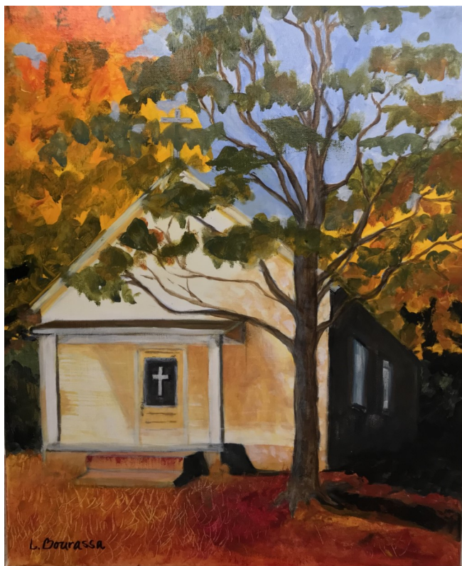
Linda Bourassa-Acrylic "Country Church"