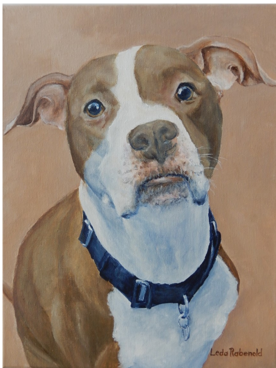
Leda Rabenold-Acrylic (3-legged) "Mookie"