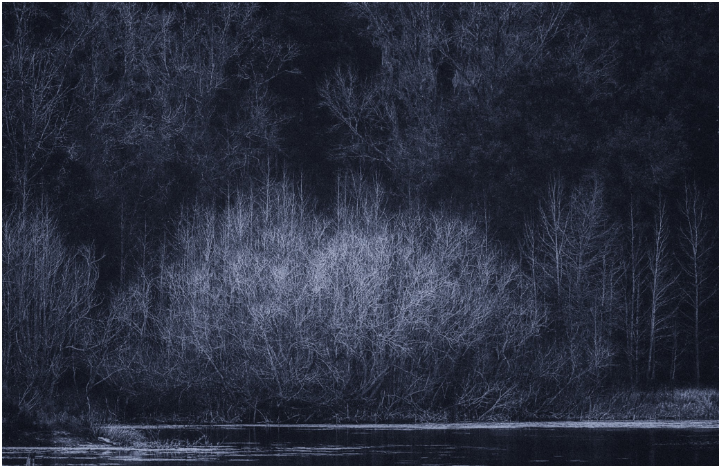
"Waters' Edge"