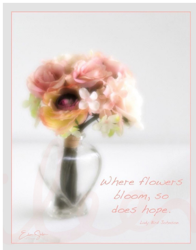
Eileen Sklon-Photography "Hope"