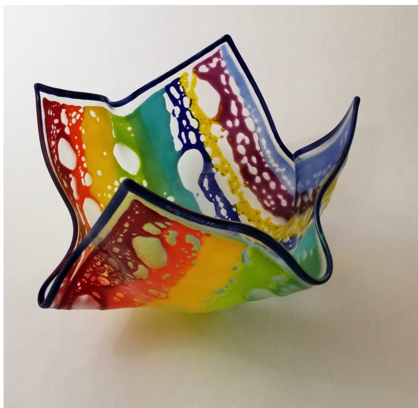
Wolfgang Mueller-Fused Glass "Lacey Bowl"