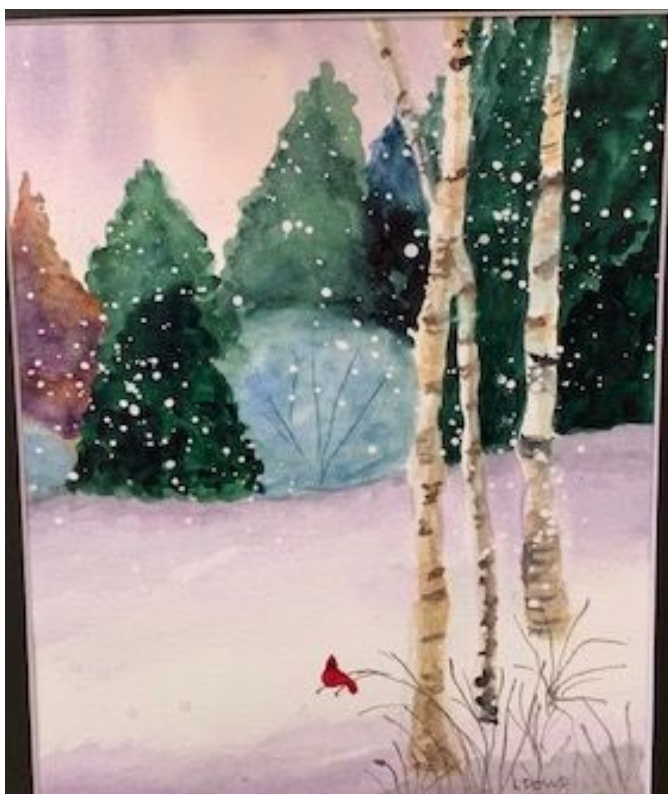
Lois Dowd-WC “Forest in Winter”