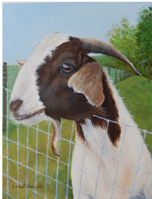
Leda Rabenold-Acrylic “A Goat Named Evandel”