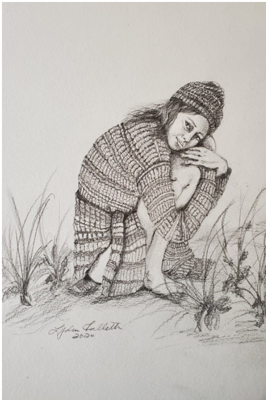
Lydia Falletti-Pencil Sketch "Holding ON"