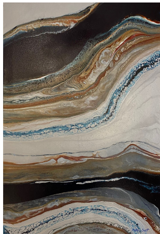
Kathi Scott-Acrylic Pour "River Run"