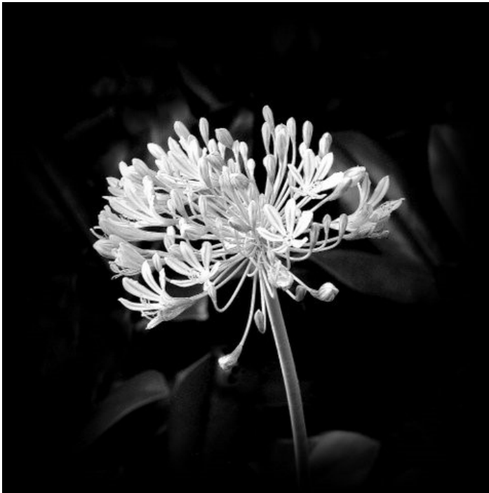
Helen Poor-Photo Illusion "Summer Memory in Moonlight"