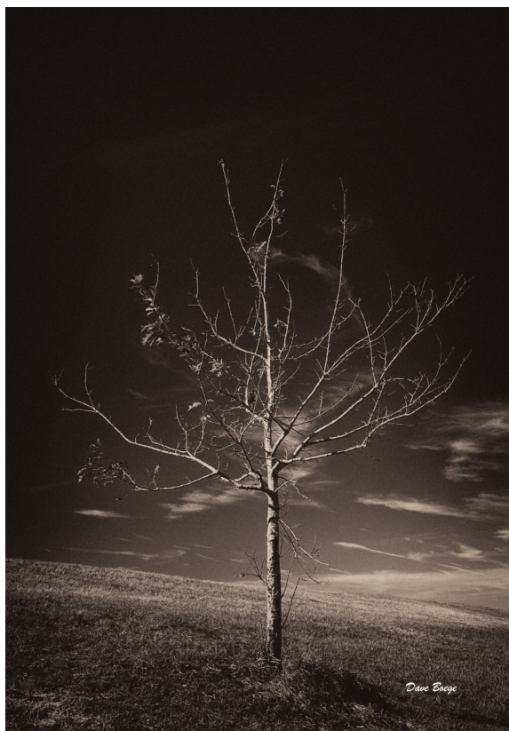
"Isolated Tree"