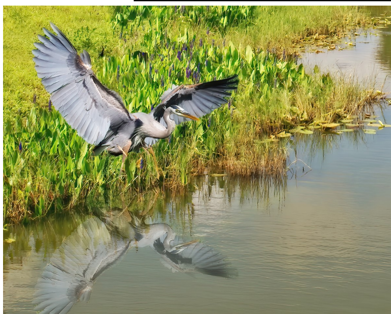
Maureen Terrien-Photo "Heron at Waters Edge"