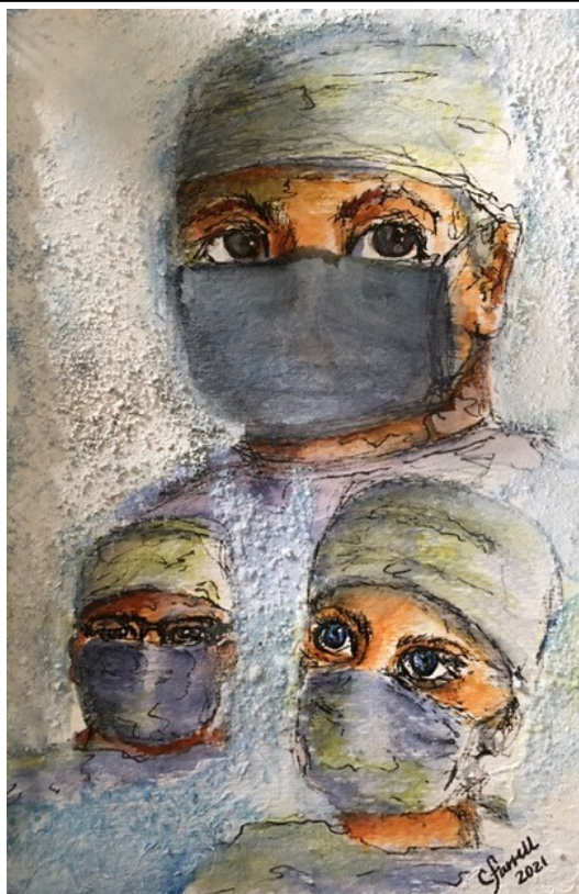
Colleen Farrell-WC, ink, acrylic w/salt "Life Savers"