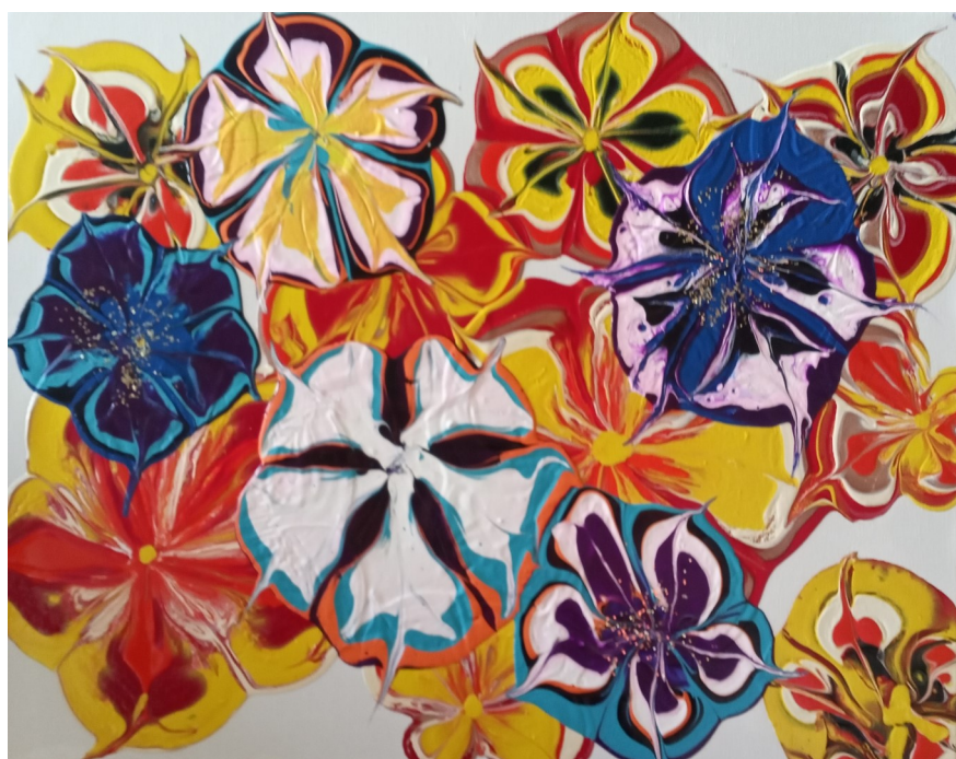
Linda Holcomb– Acrylic Pour “Happy Day”