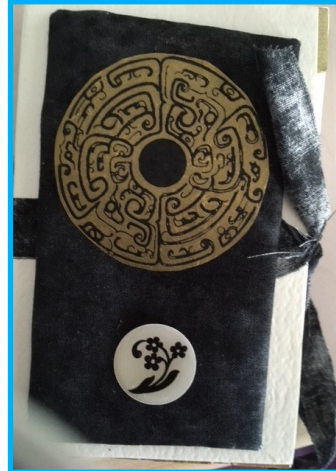
I have been doing small mixed media journals.